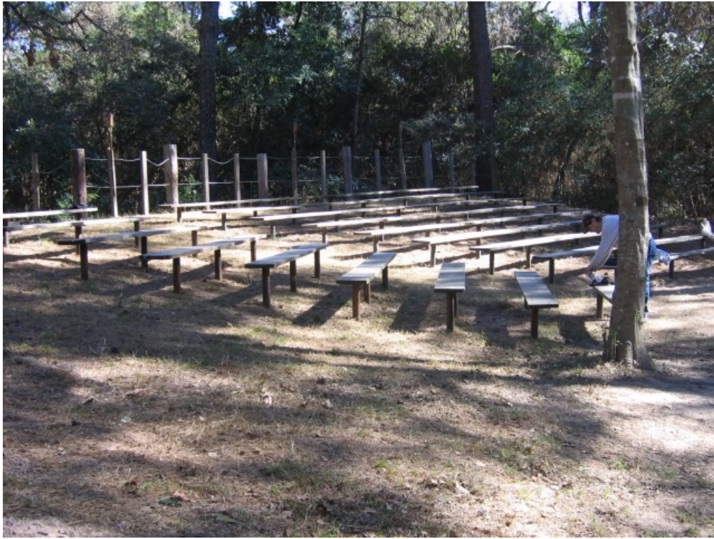
Entrance to Family & Guests seating area. Tiki torches were attached to the two posts on either side of the path at the top of the ramp.