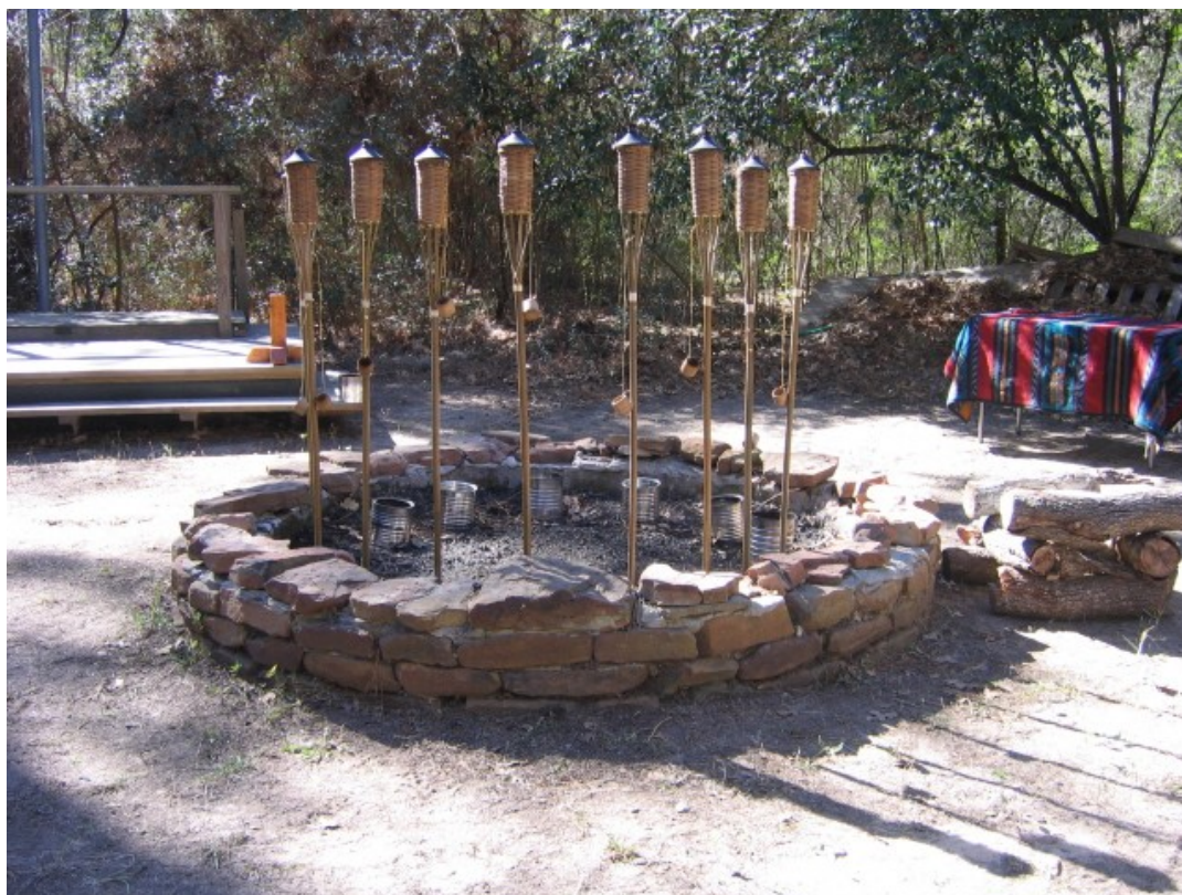
Boy Scout fire pit with torches. Note smudge pots (metal cans) inside fire ring in which Duraflame logs were burned during ceremony. Bucket for extinguishing hand-held torches, to front right of fire ring, is surrounded by logs to hide it.